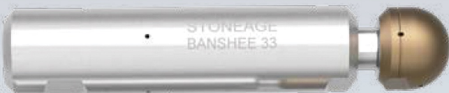
BN33 1.5-2.4 in. I.D. Tubes (38-60 mm)